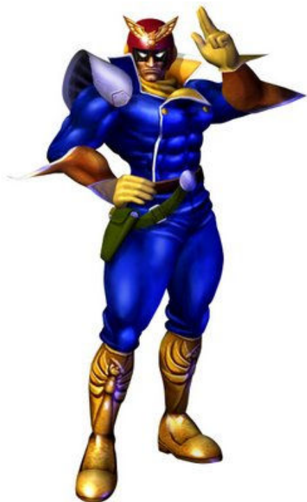
Captain Falcon, F-Zero Champion